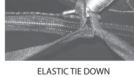
ELASTIC TIE DOWN These attacments are on the inner ring of the frame pad and should be tied into the v-ring closest to them.

over the the toprail frame and then hooked into the V-Ring closest to them.